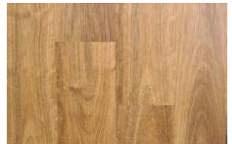
Warm Spottedgum -14650