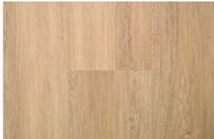
Maize Natural Oak - 41120