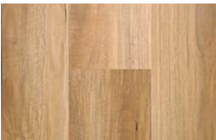
NSW Spotted Gum - 41180