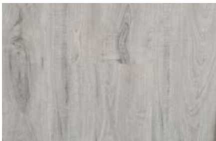
Grey Royal Oak - 41050