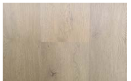
Royal Harmony Oak - 41160