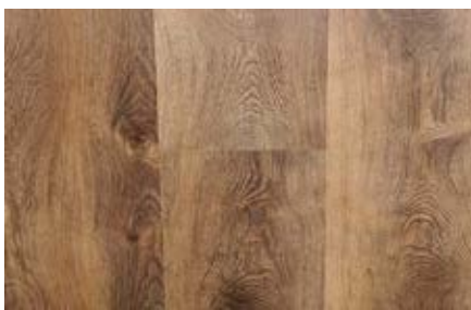
Natural Oak- 14620