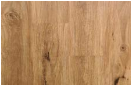
Coastal Blackbutt - 14630