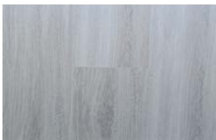
Pale Silver Oak - 14740