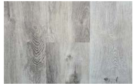
Grey Shadow Oak - 14680