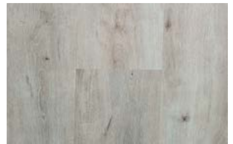
Bleached Washed Oak - 41040