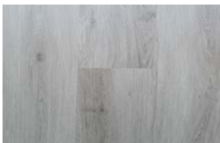
Grey Country Oak - 14730