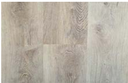
Smoked Oak - 14610