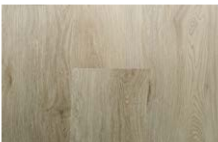
Blonde warm oak - 14700