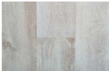
White Rustic Oak -14670