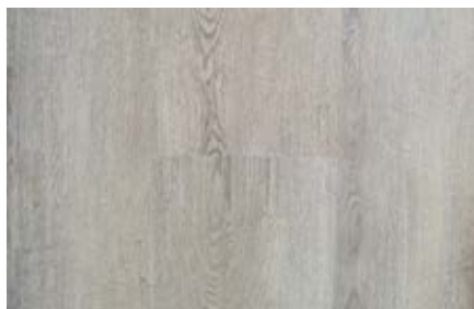
Mountain Royal Oak - 41070