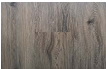
Moody Oak - 14720