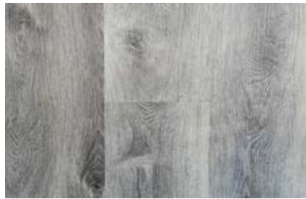
Carbon Oak - 14690