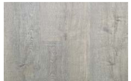
Mountain Rustic Oak - 41090