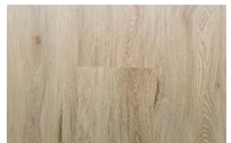
Harmony Natural Oak - 14710