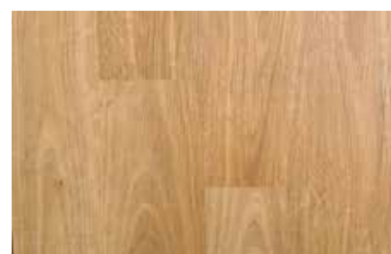
Natural Spottedgum -1464