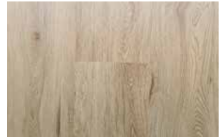
Harmony Natural Oak - 7111