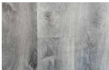
Carbon Oak - 1469