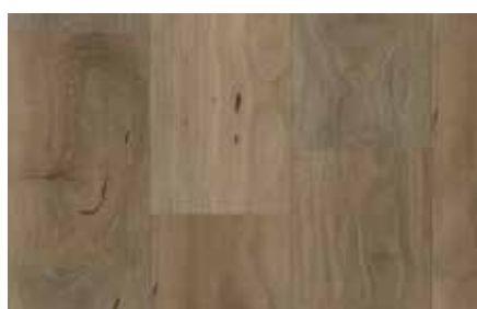
NSW Spotted Gum - 4111