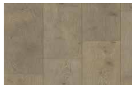
Royal Harmony Oak - 4116