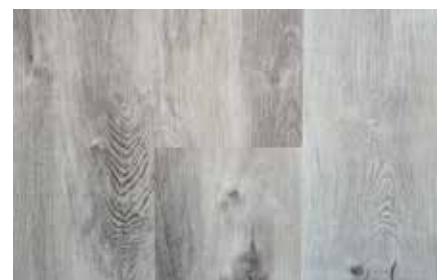
Grey Shadow Oak - 1468