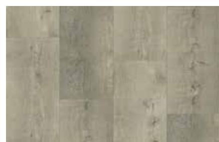
Mountain Rustic Oak - 4109