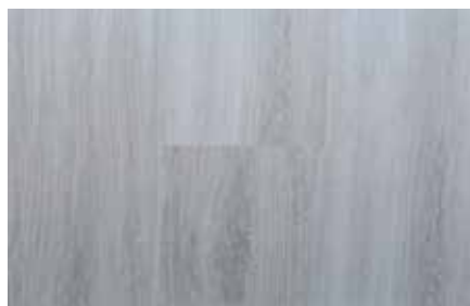
Pale Silver Oak