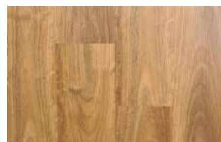
Warm Spottedgum -1465