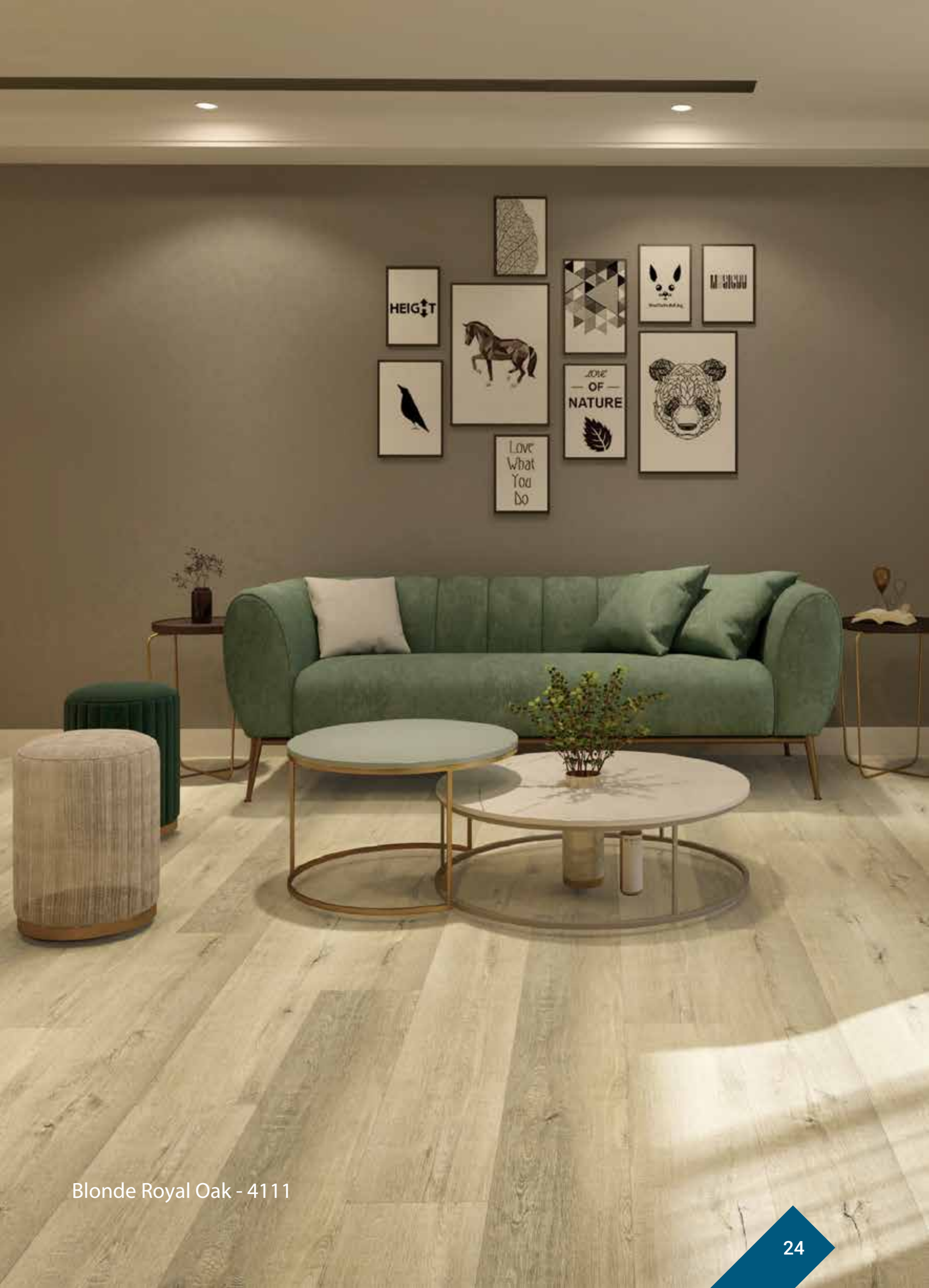
Blonde Royal Oak - 4111