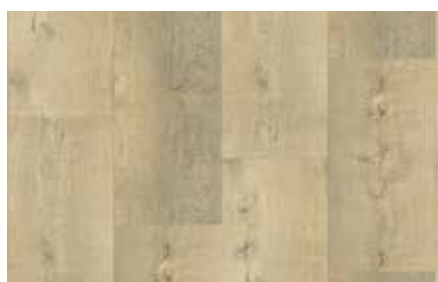
Blonde Royal Oak - 4111