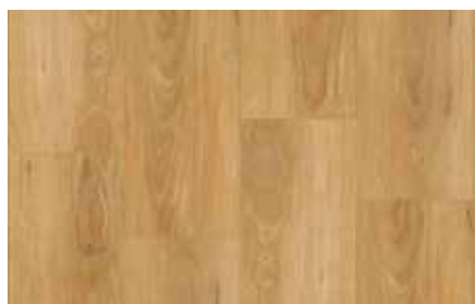
Natural Blackbutt - 4102