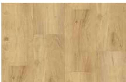
Sandy Oak - 4103