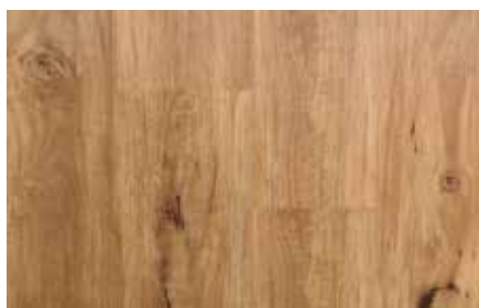
Coastal Blackbutt - 1463