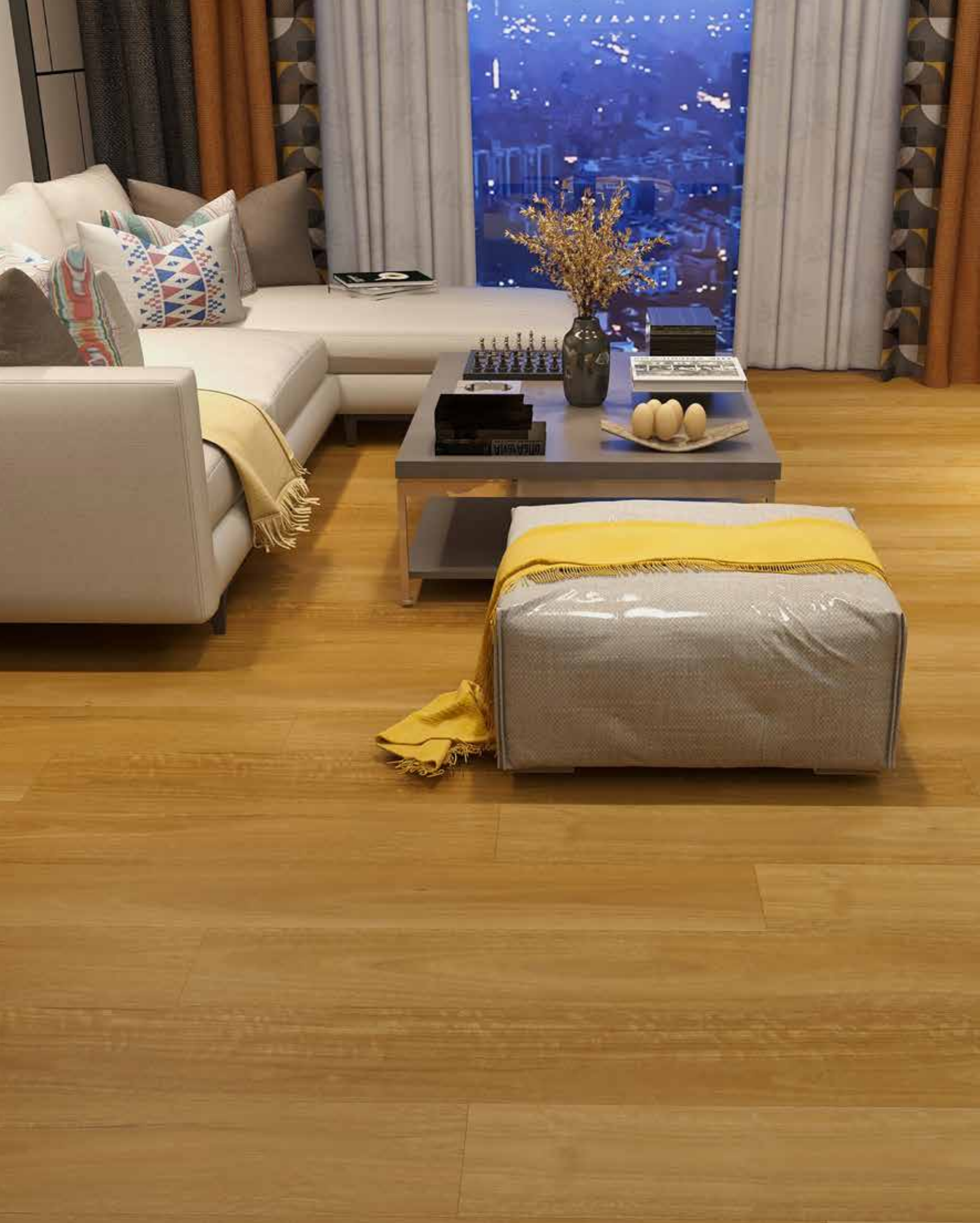
Natural Spotted Gum - 1464