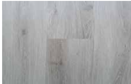
Grey Country Oak - 7114