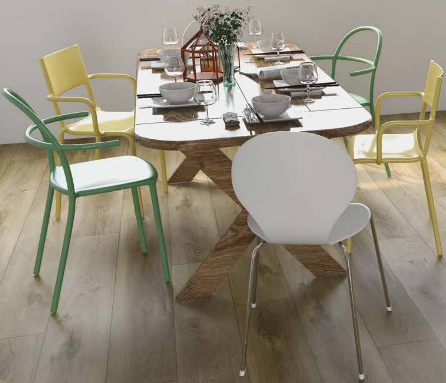
Smoked Oak - 1461