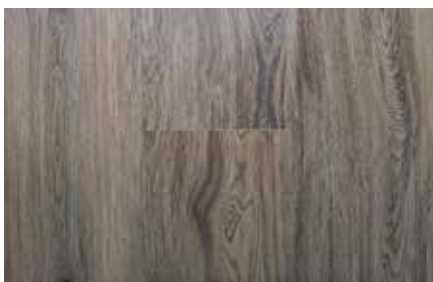
Moody Oak - 7112