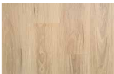
Natural Blackbutt - 1466