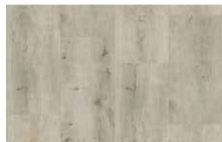
Bleached Washed Oak - 4104