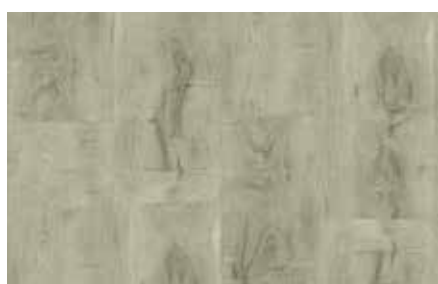
Grey Royal Oak - 4105