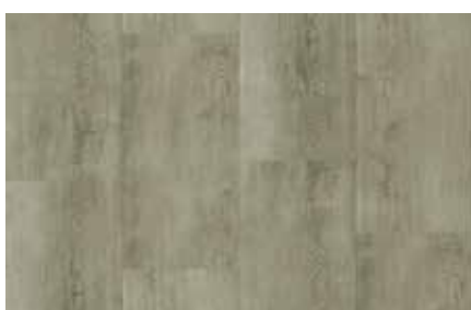
Mountain Royal Oak - 4107