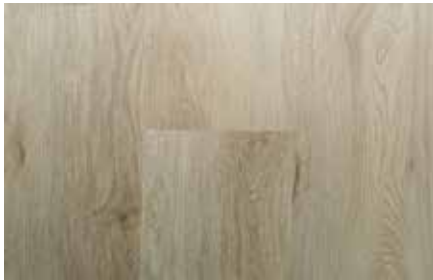
Blonde warm oak - 7110