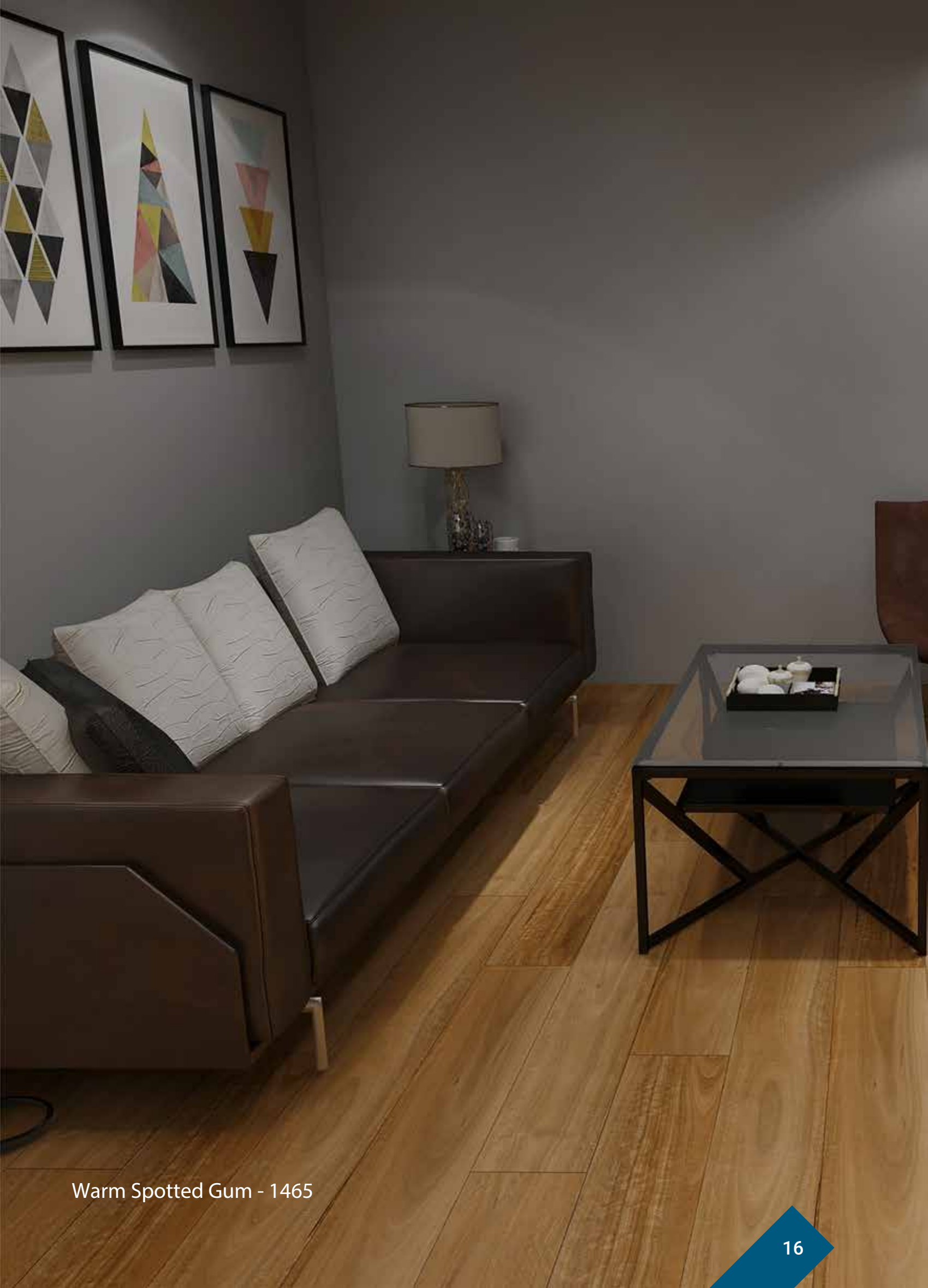
Warm Spotted Gum - 1465