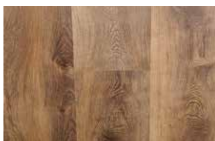
Natural Oak -1462