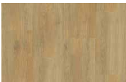
Maize Natural Oak - 4112