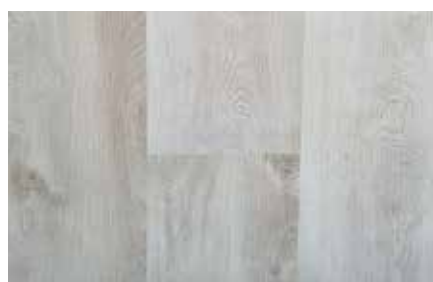
White Rustic Oak -1467