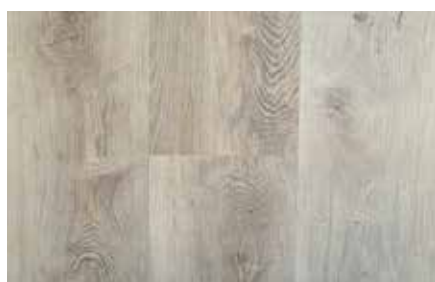
Smoked Oak - 1461