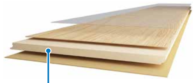
Specialised treatment in the core

Independent test certified for T-Seam - Swell & Seepage > 80hrs.