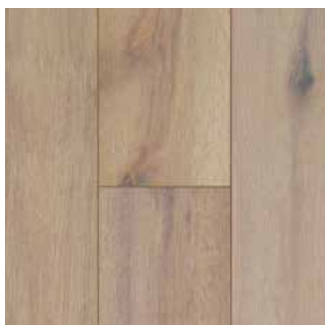
Delta Sand ●