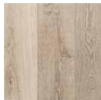
Wolf Grey ●