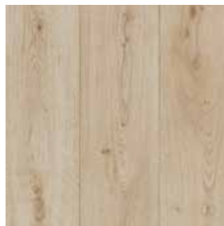
Alpine Mist ●