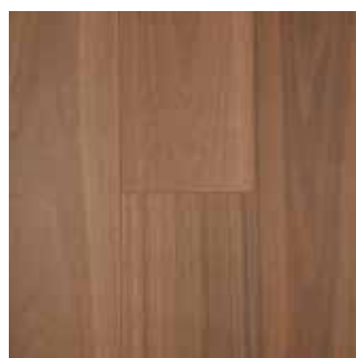
Spotted Gum ●