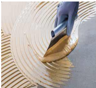
Picture 2. Plank Bonding